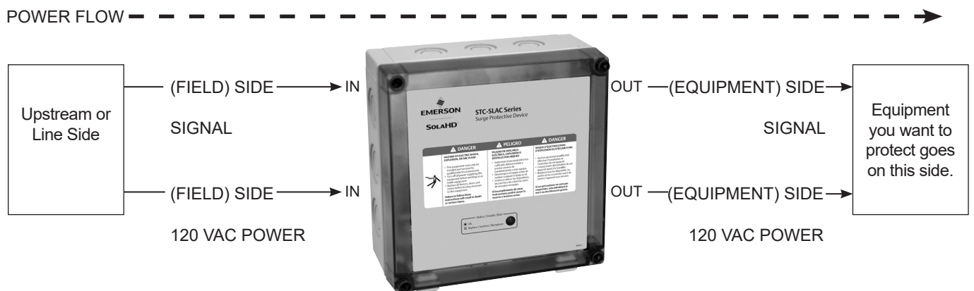
Figure 1: STCSLAC12036 Power Flow

The STCSLAC12036 is a directional surge protector. Connection must flow “in” the Unprotected (Field) Side, through the SPD, and “out” to the Protected (Equipment) Side.